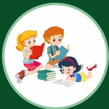
Learning Center for Early Years