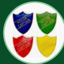
Clubs and House system