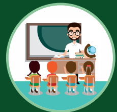
Super Saturday- Dedicated Life skills Program