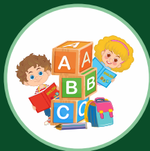
Activity Based Learning