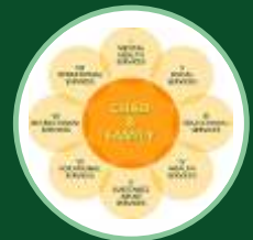
Experiential learning and child-centric approach in Early Years